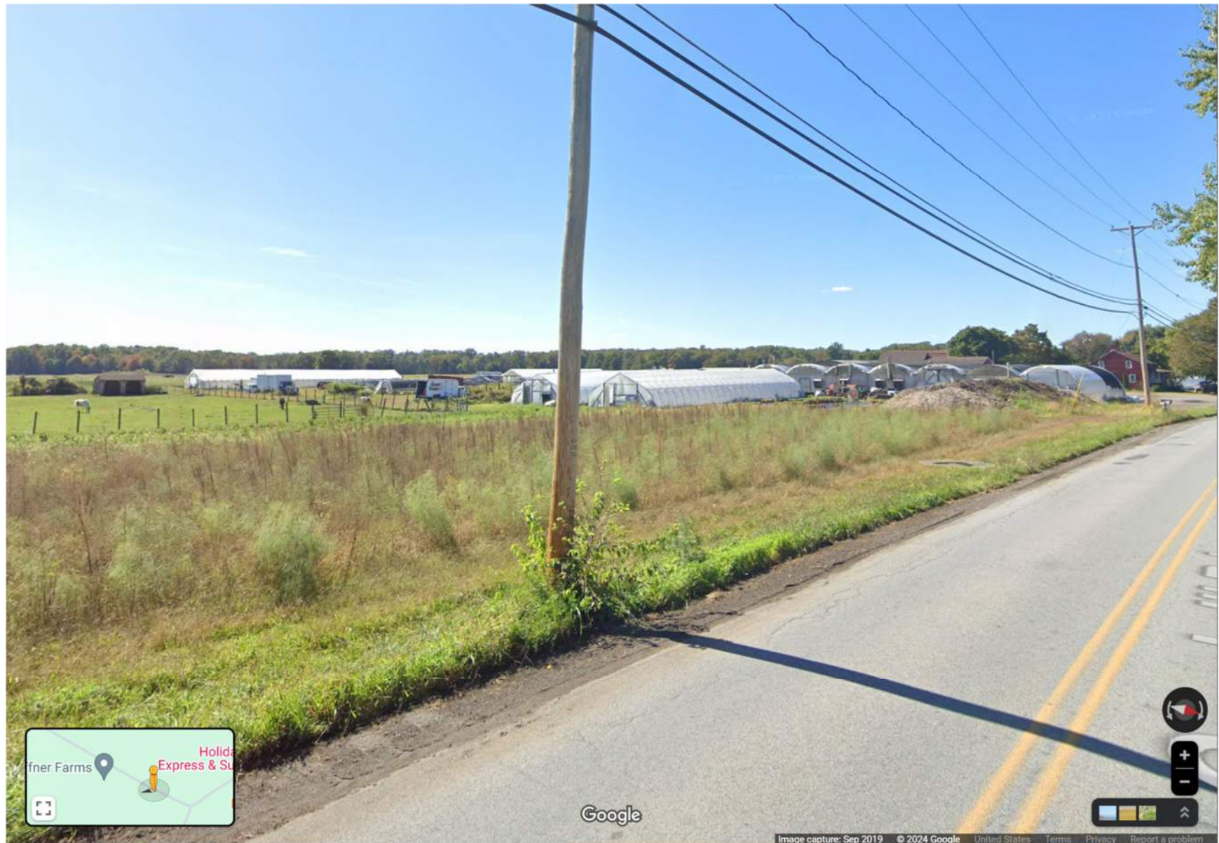
Hoeffner Farms – South side of Goodwill Road