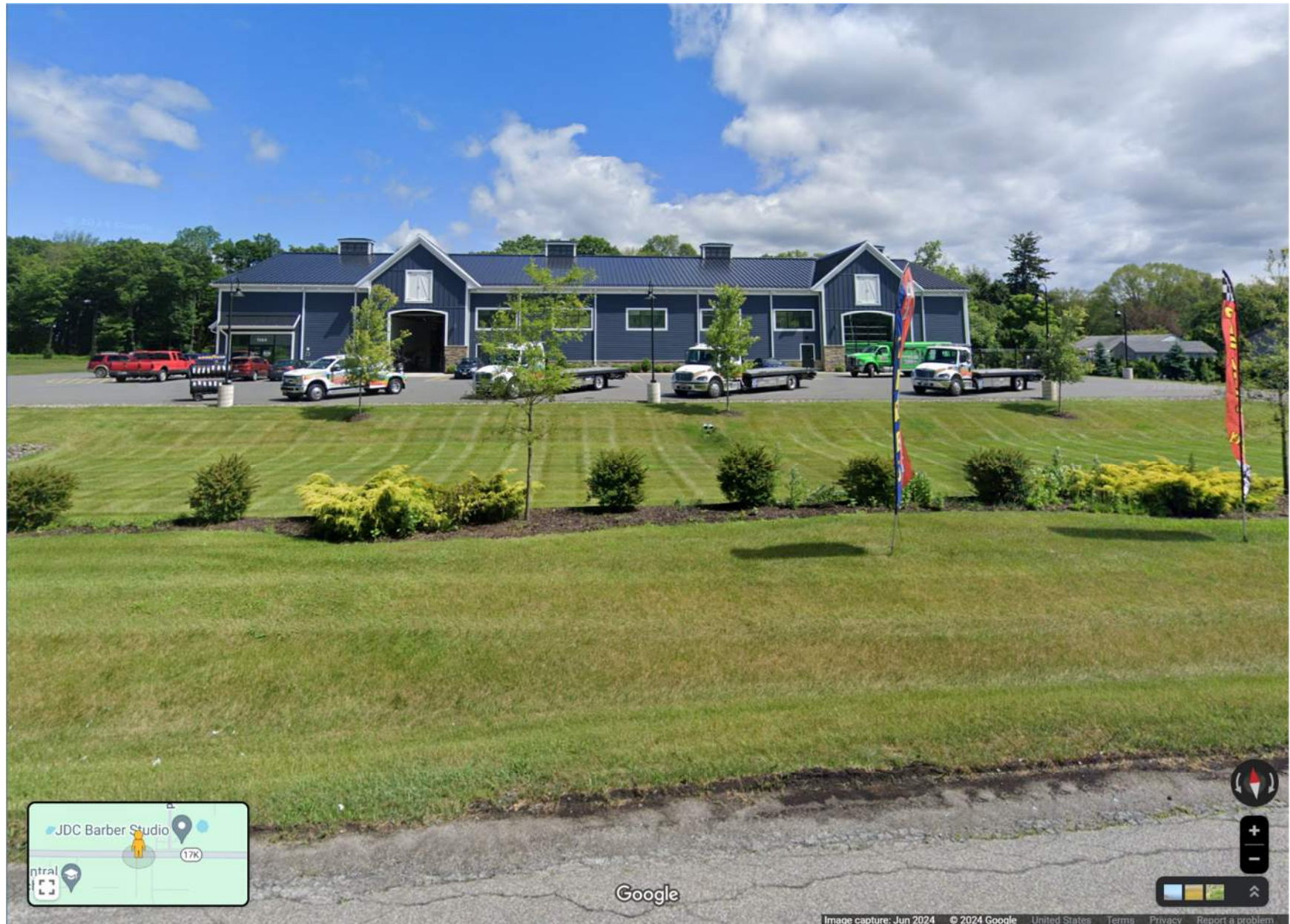
Quality Service Center auto repair shop – North side of NYS Route 17K