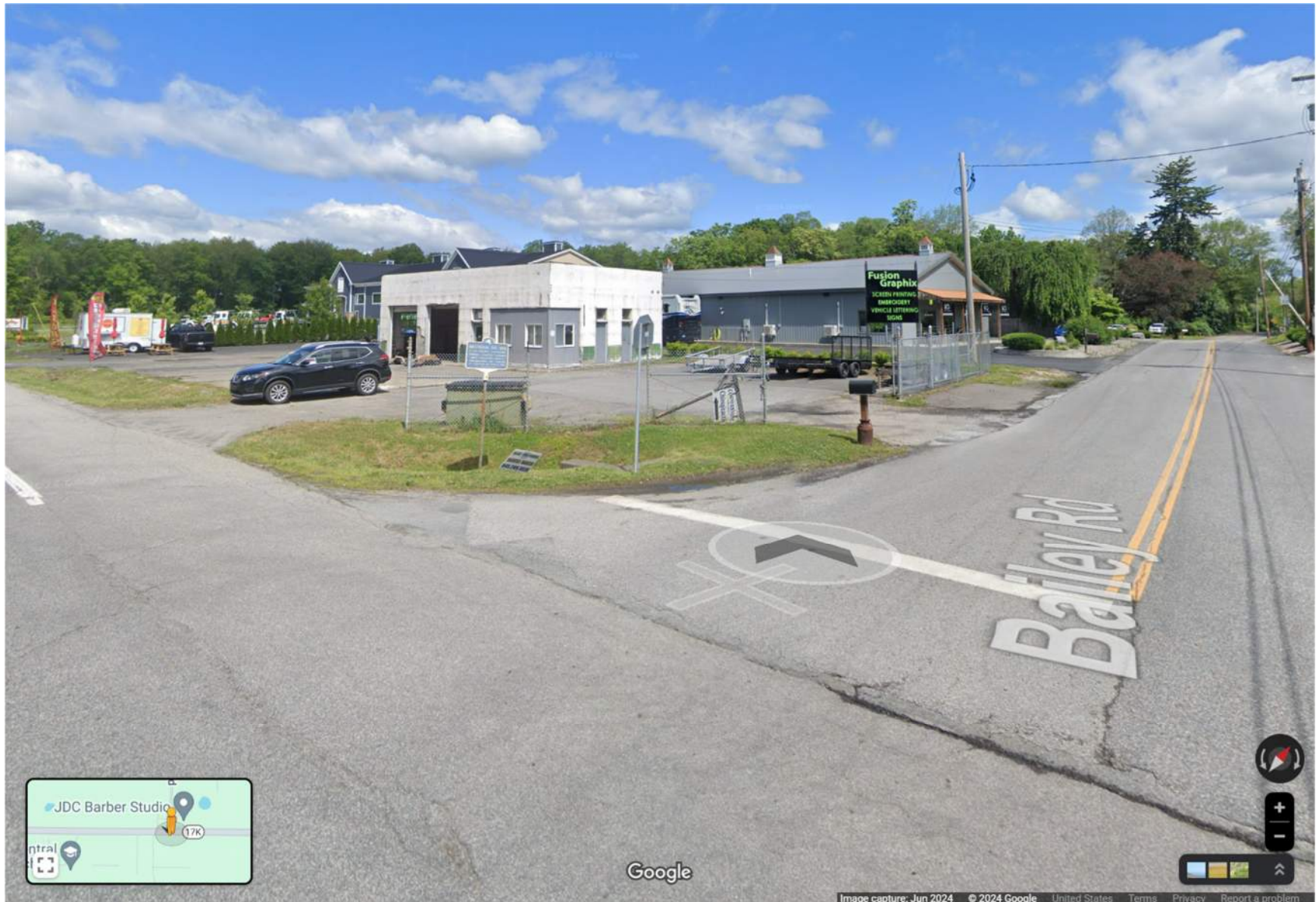
Fusion Graphix screen printer & former RV sales lot – North side of NYS Route 17K