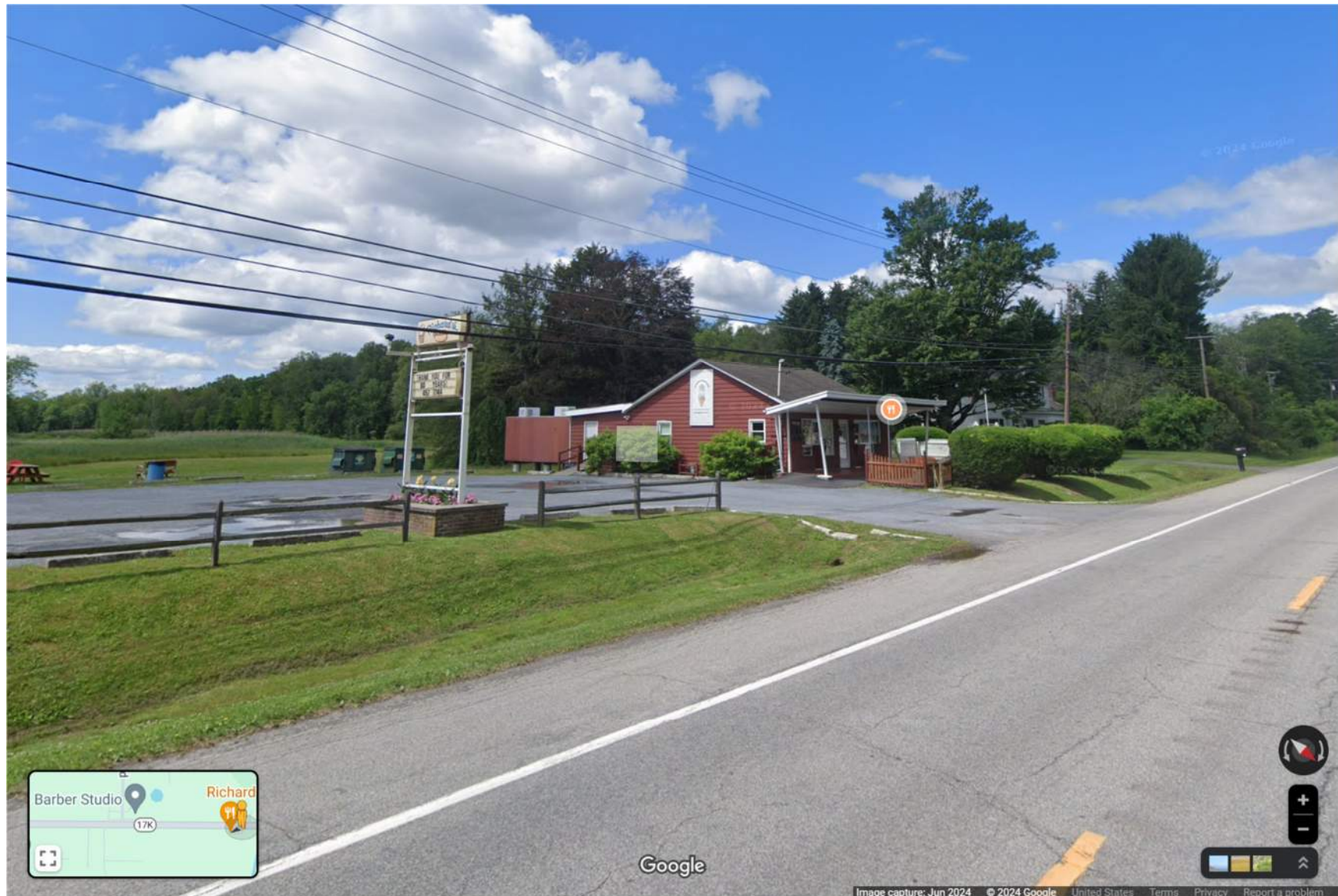
Richard's Ice Cream – South side of NYS Route 17K