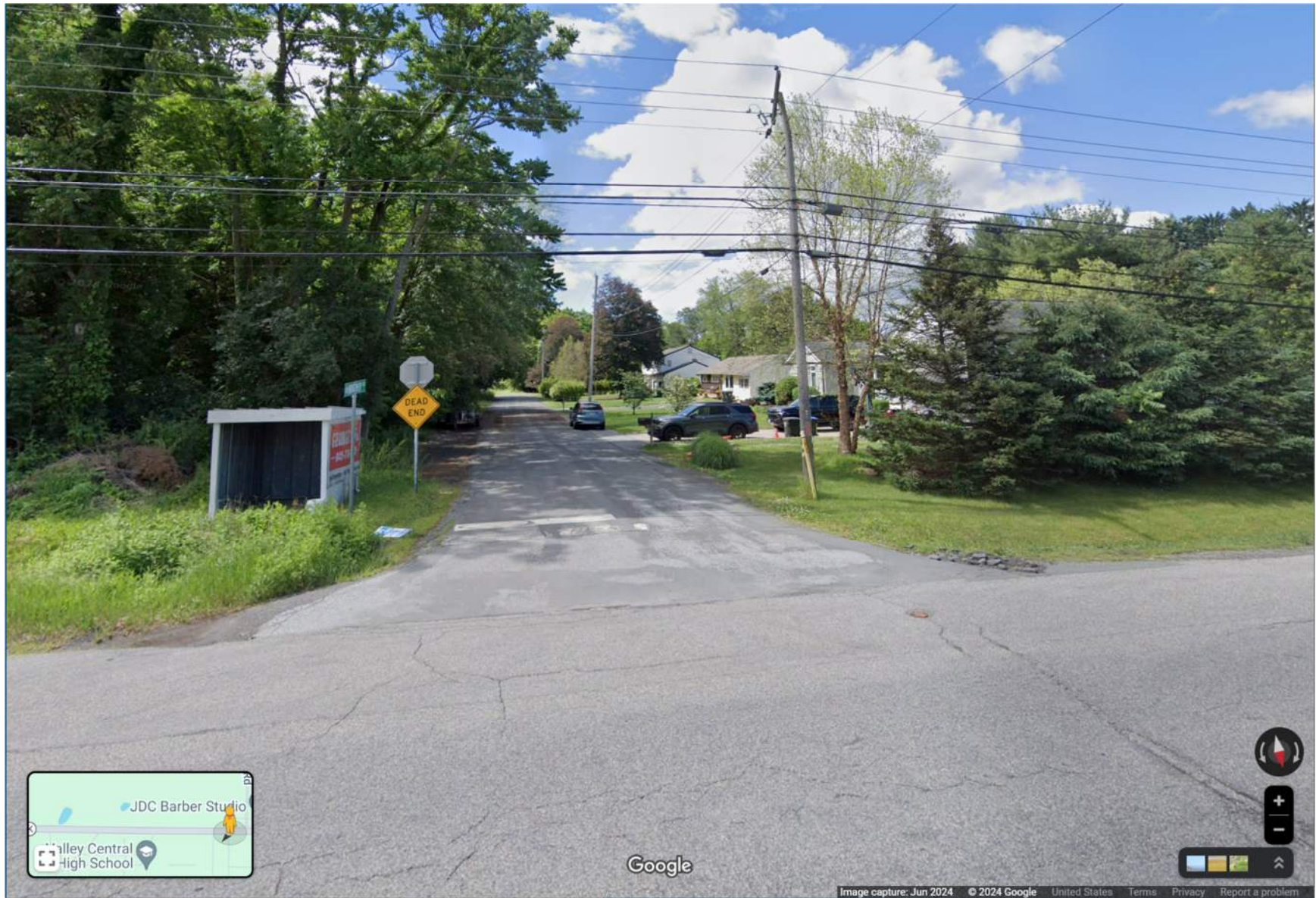
Montgomery Height subdivision – South side of NYS Route 17K