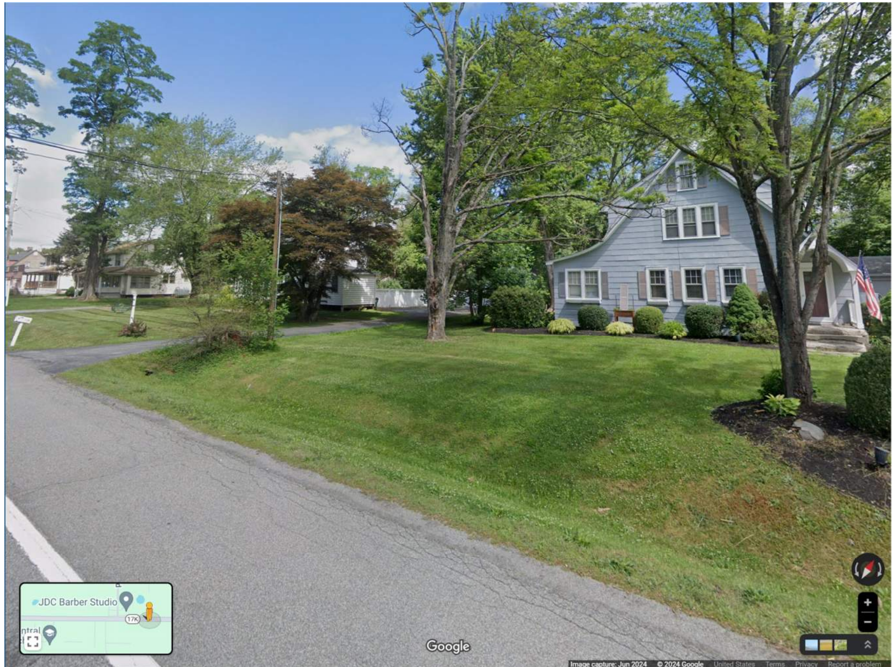
Residential Homes – North side of NYS Route 17K