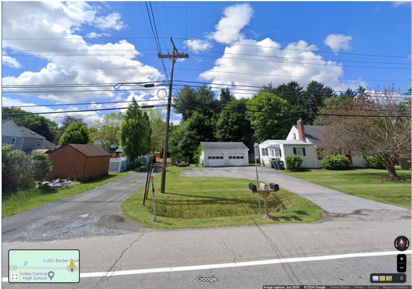
Residential Home – South side of NYS Route 17K