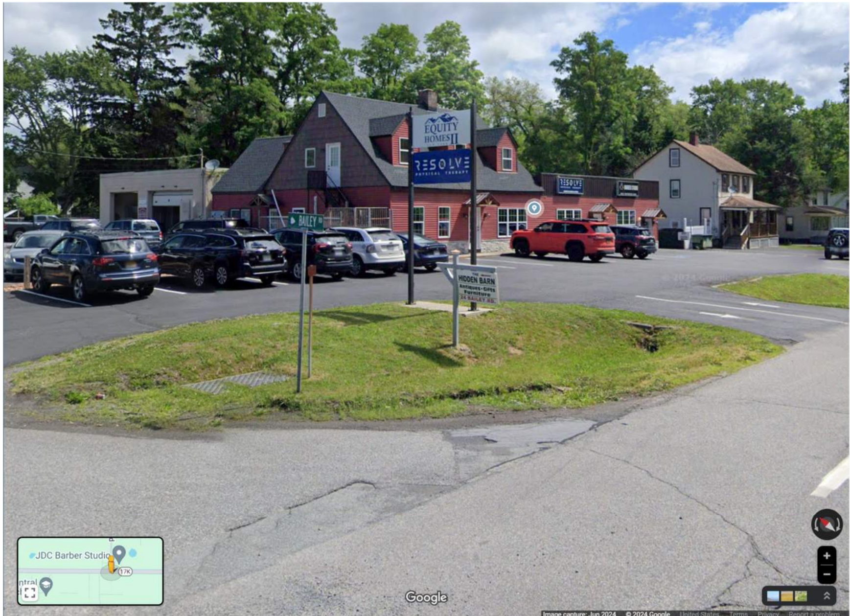
Mixed-use building containing a barber shop, physical therapy, and real estate development office – North side of NYS Route 17K