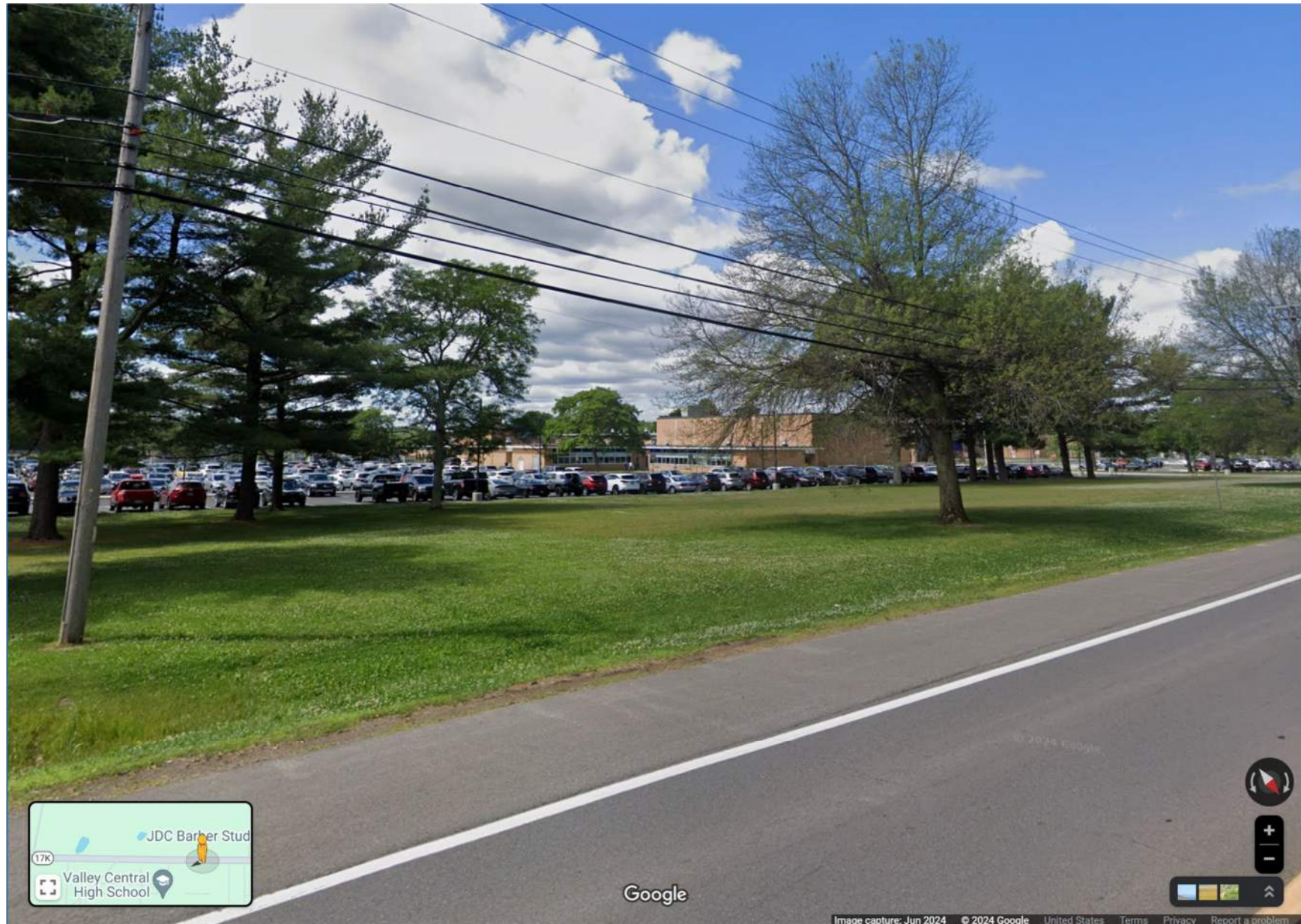
Valley Central High School - South side of NYS Route 17K