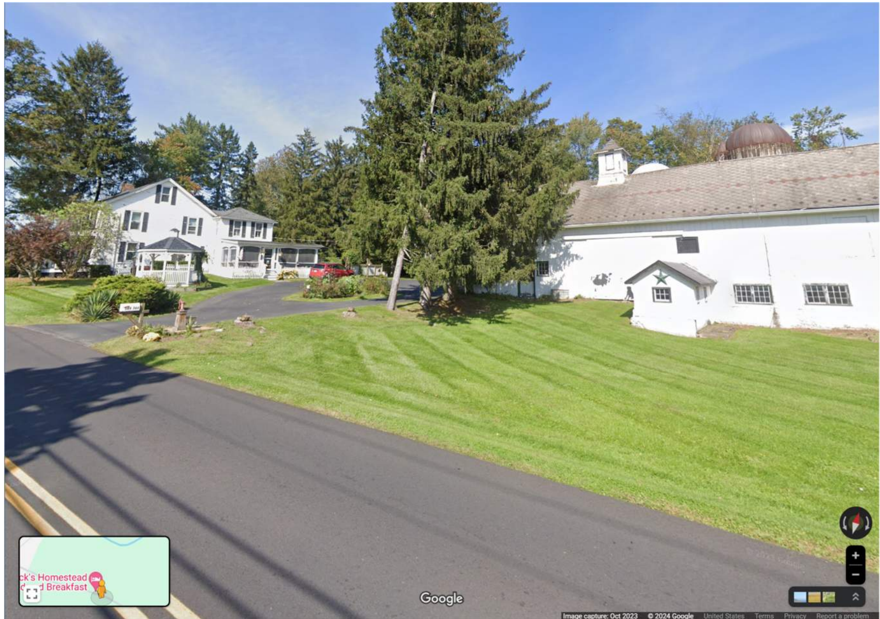
Buck's Homestead Bed & Breakfast – North side of Goodwill Road