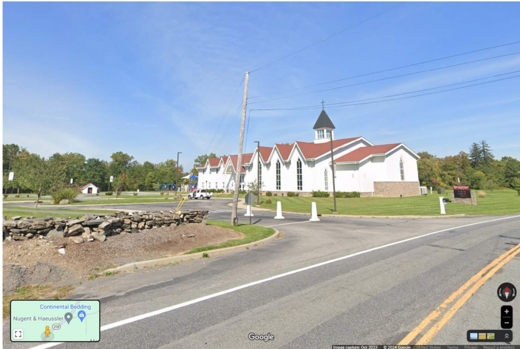
Goodwill Church – West side of NYS Route 208