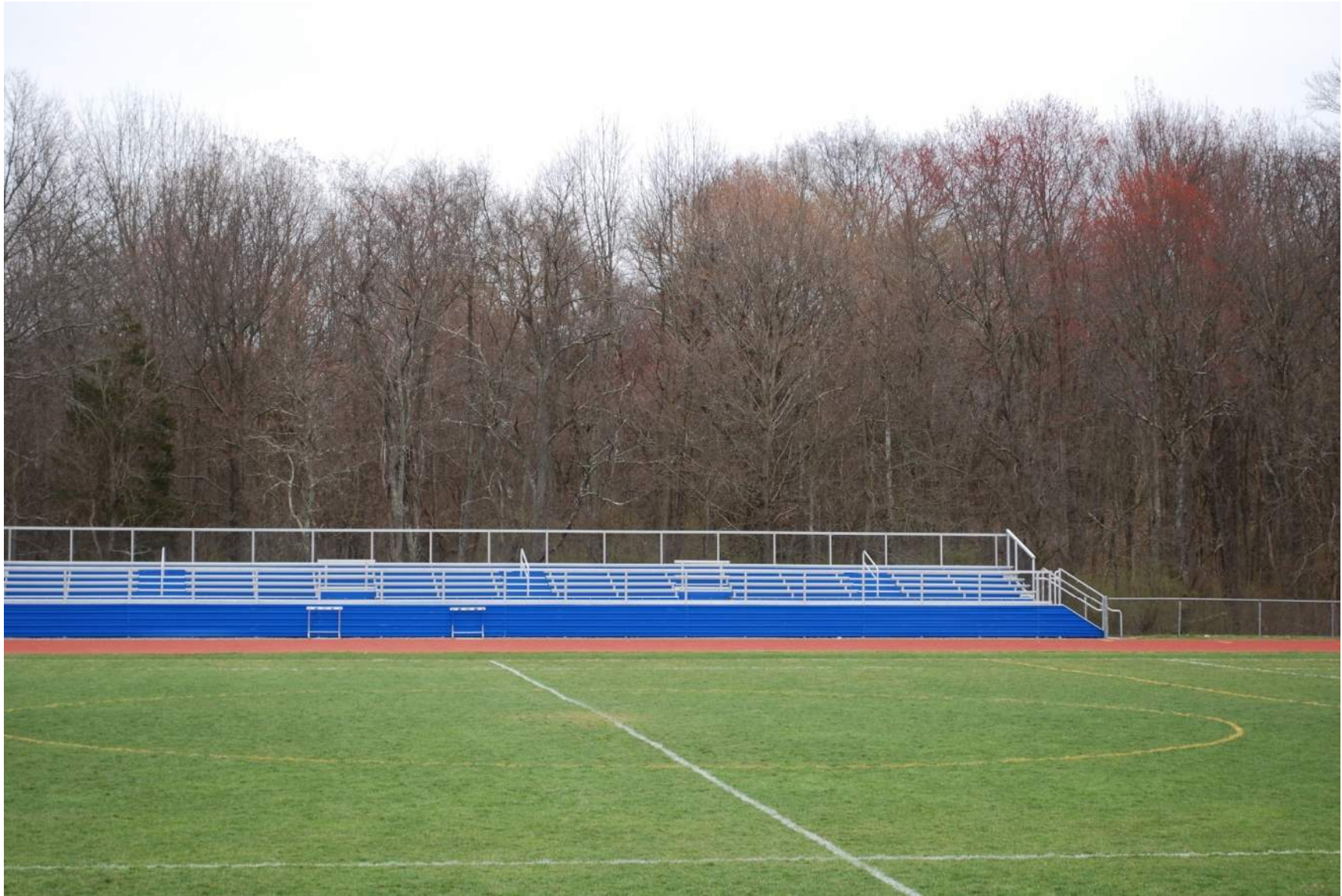
Photo taken from lower level of the VCHS Athletic Field Grandstand looking east. The project will be visible during both leaf-off and -on scenarios, though it will be buffered by existing vegetation that will remain on the Project Site.

Viewpoint Elevation: 400 ft Residential Buildings: Ground 425 ft/Roof 460 ft Water Tank: Ground 430 ft/Top 545 ft