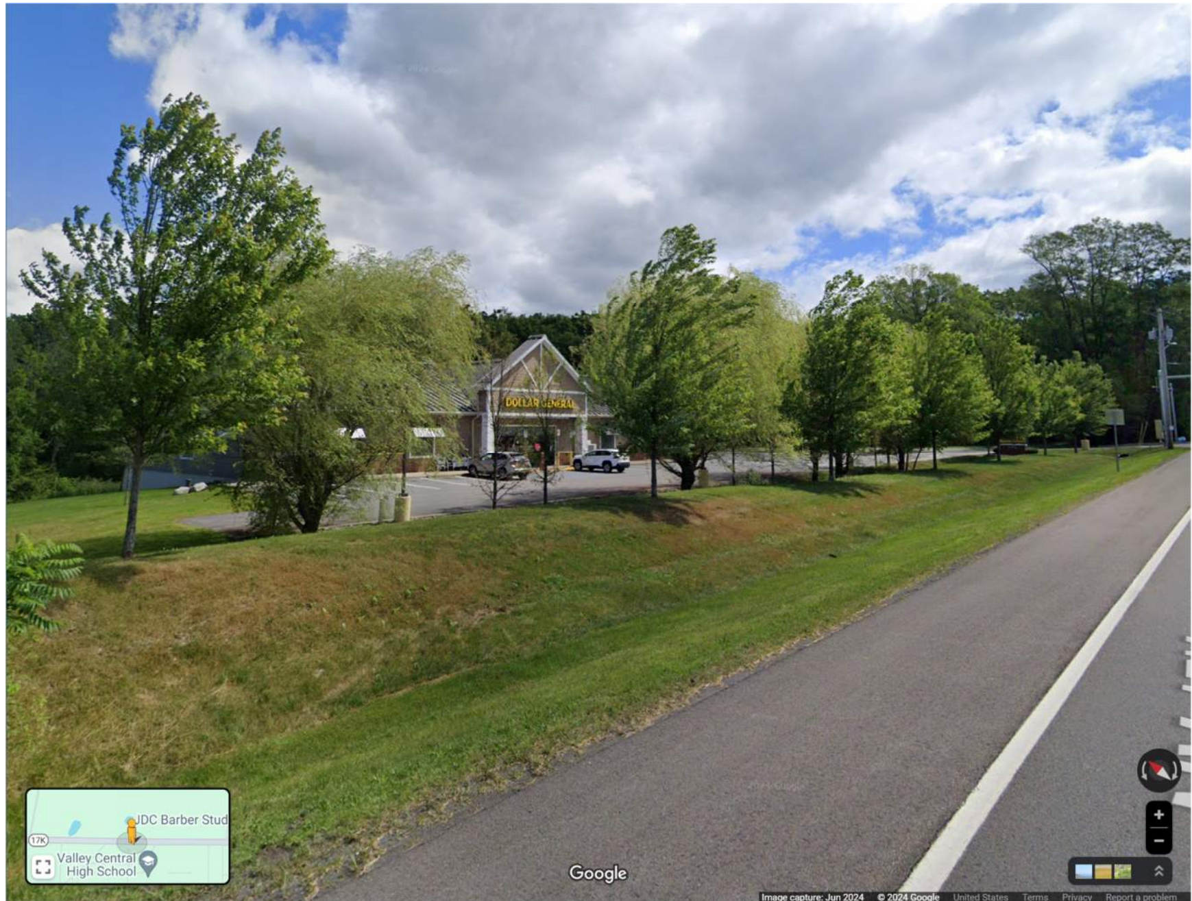
Dollar General - North side of NYS Route 17K